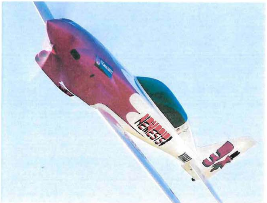
Below: Jon Sharp literally ran away from everyone in "Nemesis" for the Super Sport Gold.